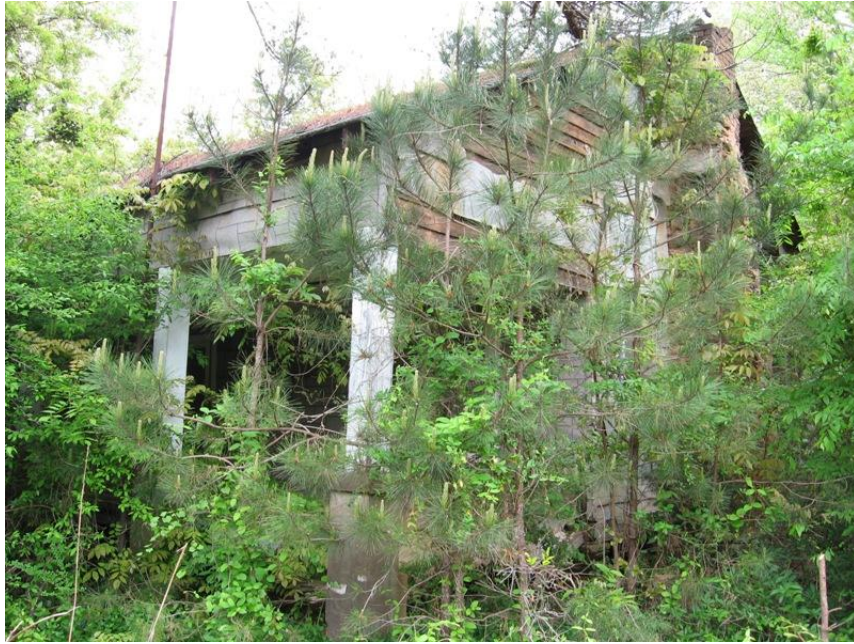
Fleming Parker Home April 19, 2009